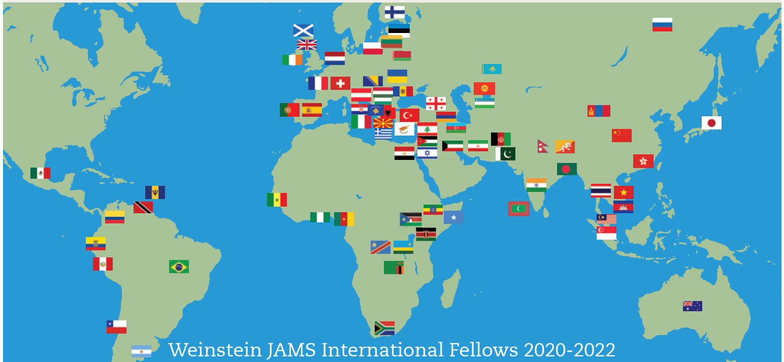
Weinstein JAMS International Fellows 2020-2022